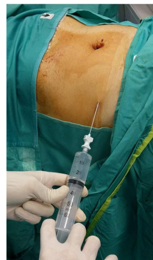
Fig. 1 One hundred fifty to 180 mL of saline solution mixed with ropivacaine and adrenaline are percutaneously injected in the abdominal subcutaneous adipose tissue to expand the spaces inside of the adipose tissue and to facilitate the successive lipoaspiration

Of the total 65 patients who received this protocol, patients (six) with Kellgren-Lawrence KOA grades III or IV, including patients with a severe ( > 10^\circ ) varus or valgus frontal deformity, were excluded from the study. Similarly, patients (three) who received also cartilage procedures such as AMIC [13] or microfracturing techniques for full-thickness chondral lesions were excluded from the study. Finally, patients (two) with a post-traumatic KOA following a previous ligament injury and patients (two) with previous knee surgery were excluded from the study. The 52 remaining patients were enrolled in the study; these 52 patients received only chondral shaving/