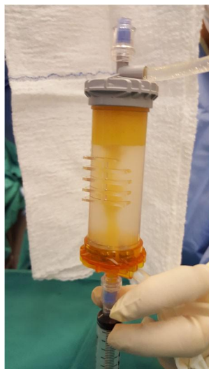
Fig. 3 The processed final microfragmented adipose tissue product is transferred to 10 mL syringes for the successive articular injection

The ethics committee of the University of Naples (Italy) did not require its approval for the review of patient records or images. All the patients were fully informed of the surgical procedure, treatment duration, and potential complications. All patients signed written informed consent allowing for the surgical procedure. For this type of study, formal consent is not required. Patient demographics and outcomes were described using means and ranges. Improvements relative to the mean IKS and VAS scores analyzed using a Student's t test for paired data. Differences in IKS and VAS scores in patients with high (> 8) and low (< 8) at presentation were tested by Student's t test for non-paired data. The threshold for statistical significance was defined as p < 0.05 .